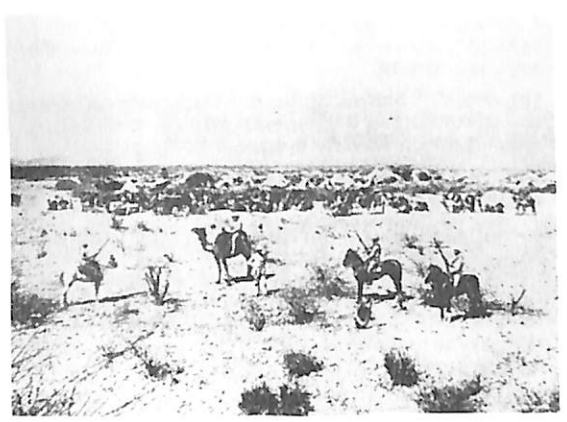
The camp site of the Suakin Field Force at Tanbuk.

recruitment but was not officially involved. Secondly, the voyageurs were civilian not military personnel. They were neither part of the military forces of Canada nor regarded as combatants in the Sudan. 44 Their status was that of civilians working under a special contract. Most of them had returned to Canada by the time the Australians arrived in the Sudan at the end of March 1885.