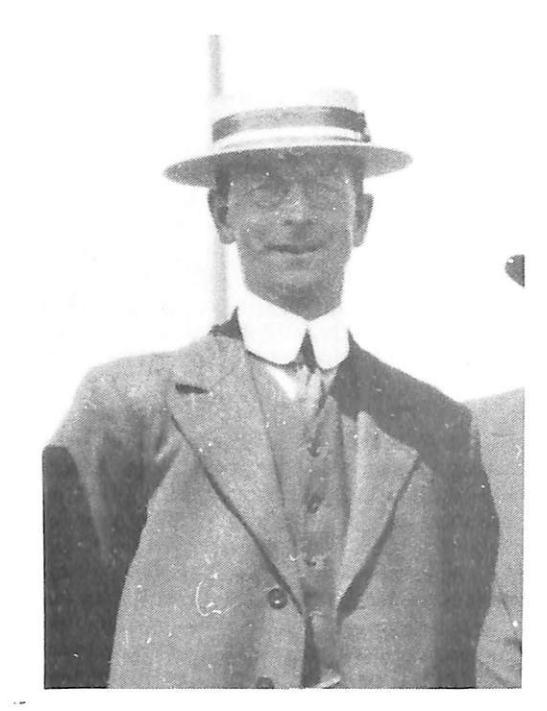
C. E. W. Bean. Photograph (AWM A5379)

despatch to interpret differently the Anzac's performance. Thus there were those who hailed the troops as valiant, if undisciplined, sons of empire, and those who praised them as Australia's fighting men.