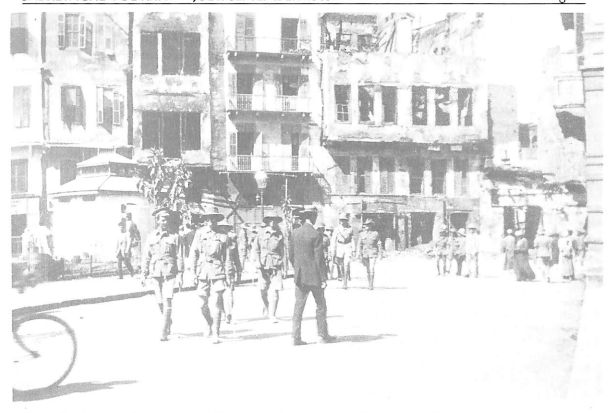
Australian troops on the edge of the Wazza after the riots of 1915.

By 1974, when Bill Gammage's The Broken Years appeared, there was even less compunction over relating similar incidents: