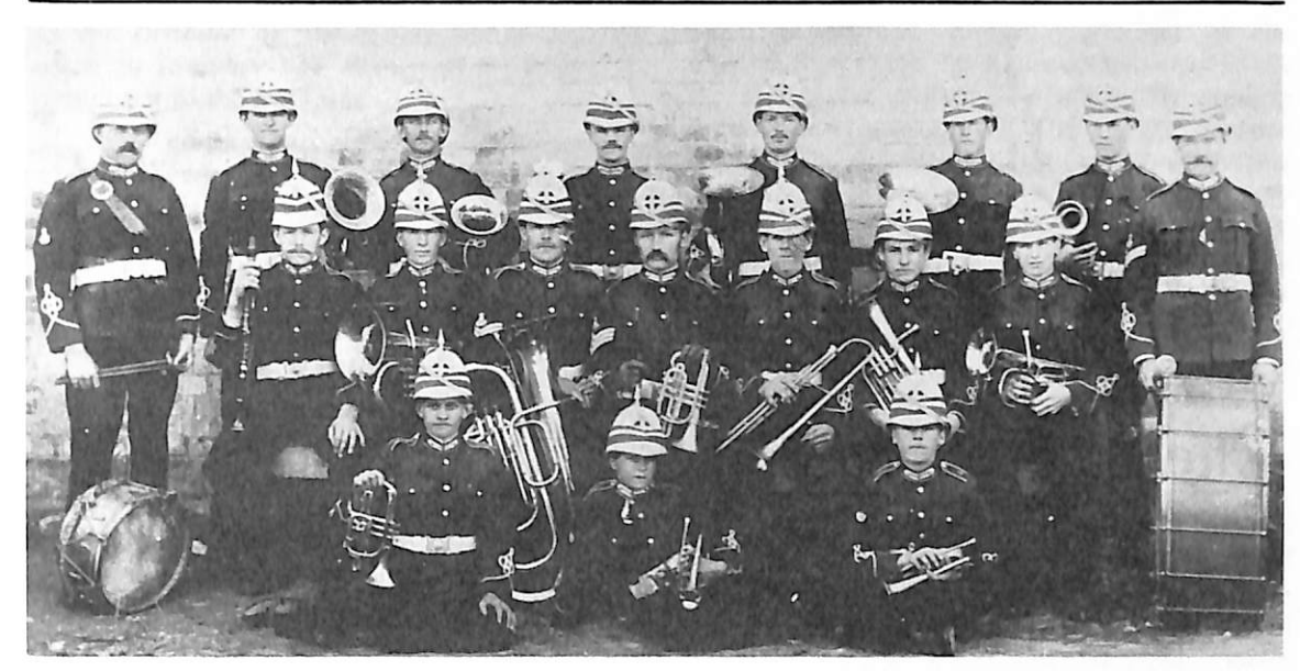
The band of the Australian Rifles 1899.

Church, Strathfield, NSW, on 17 December 1939.