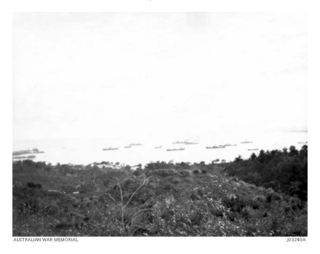
Fig.1: The Australian squadron (including HMAS Grantala) in Suva Harbour, Fiji after the capture the German colony at Rabaul

The story of HMAS Grantala was omitted from Peter Plowman's recent book, Gallipoli Voyage ' which also covered the fleet in the capture of the German colonies in 1914. This work makes reference to the fleet stores ship and collier, thus the omission of HMAS Grantala is puzzling. The service of nurses on HMAS Grantala is also omitted from the National Nurses Memorial on Anzac Parade, hence the reason for this article.