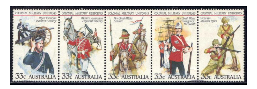
1985: Colonial Military Uniforms showing left to right, the Royal Victorian Volunteer Artillery, the Western Australia Pinjarra Cavalry, Cavalry, NSW Lancers, NSW Contingent in the Sudan and the Victorian Mounted Rifles. Renniks catalogue # 885

The next set to be issued entitled Colonial Military Uniforms showed soldiers in a context of engagement and aggression.