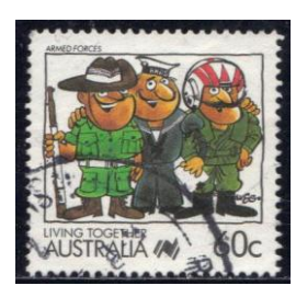
1988: Living together / Armed Services. Renniks catalogue # 1074.

The next illustration shows Australia's Armed Services as 'larrikins' whilst emphasizing Defence as an entity rather than as separate services. This stamp was issued as one stamp in a set of 26 entitled Living Together .