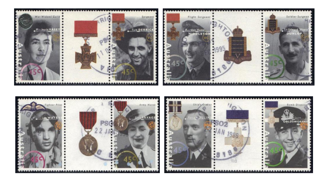
1995: Australia Remembers , the 50<sup>th</sup> anniversary of the end of World War II. Renniks catalogue #s 1492a and 1522