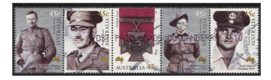
2000: Centenary of Australia's first Victoria Cross. Renniks catalogue # 2002

In 2008 Australia Post issued a miniature sheet entitled Lest we Forget and three other miniature sheets showing the same stamps. One of these commemorated the finding of HMAS Sydney during 2008.