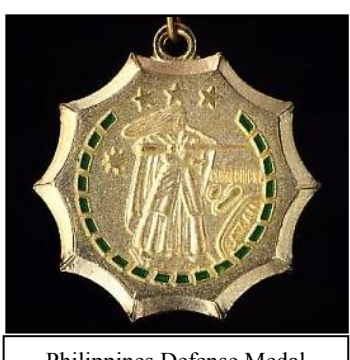
Philippines Defense Medal

The Philippines Defense Ribbon was established by Army Headquarters, Commonwealth of the Philippines on 22 December 1944. A medal to accompany the ribbon was instituted by Army Headquarters on 22 July 1945. The medal rewarded members of the Armed Forces of the Philippines, the US Armed Forces and recognised guerrilla units for at least 30 days' service, or service in any combat operation, between 8 December 1941 and 15 June 1942. A commemorative panel at the Pacific War Memorial on Corregidor Island lists the campaigns which comprised the _Defense of the Philippines', and the American Military Cemetery at Fort Bonifacio, Taguig City in Manila contains murals depicting these various defensive operations.