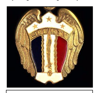
Philippines Liberation Medal

of the Philippines', and the American Military Cemetery at Fort Bonifacio contains murals depicting the landings at Leyte and Lingayen Gulf.