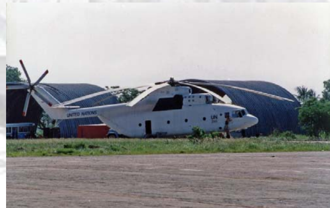
(A couple of pics with labels and we elaborate on the content.)