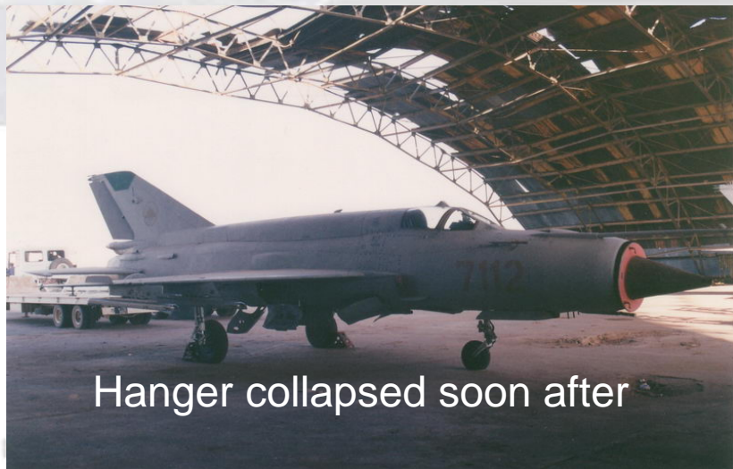
Hanger collapsed soon after